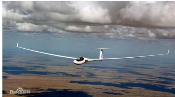
Figure 4. Fuel cell aircraft: Antalis.

The world's first commercial 100% electric E430 aircraft, manufactured in China, underwent a successful test flight on July 28, 2010, during the "Flying Conference" at Oshkosh Airport, Wisconsin, reaching a height of roughly 3000 meters (Figure 3). At the test site, there were 800000 spectators and around 10,000 aircraft, including the China E430 electric aircraft creative design team. The E430, which has a round shape and a V-shaped tail wing, a wingspan of 13.8 meters, a fuselage of roughly 7 meters, and the capacity to carry two passengers, was successfully taken offline in January 2009. Its performance is far superior to that of similar products around the world. On January 24, 2009, the E430 took off for the first time at an airport outside of Shanghai and achieved a number of technical milestones that qualify as the first in the world: the maximum takeoff weight is 430 kg; the top speed is 150 km/h; the economic speed is 95 km/h; it can be renewed for 2-3 hours; the charging time is 3-4 hours; and it costs about $5 per charge.