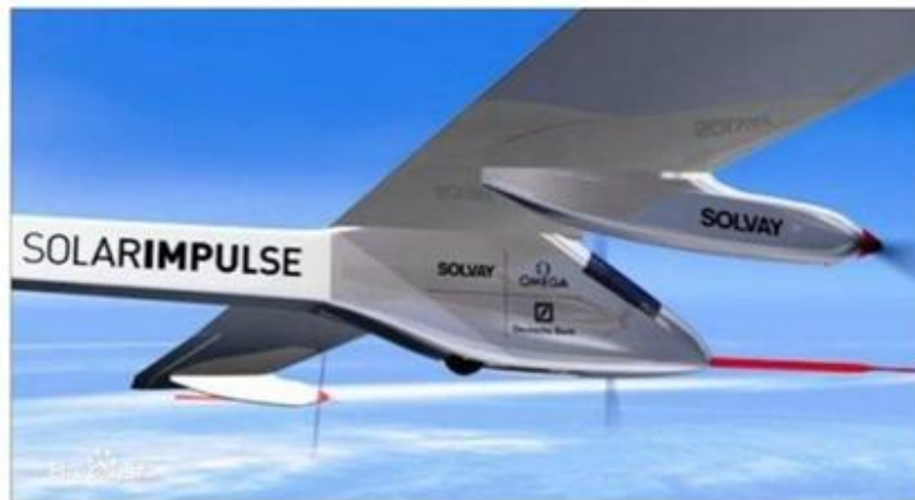
Figure 2. Solar aircraft: the Sunshine Power.

The primary distinction between electric and conventional aircraft is that electric motors, as opposed to internal combustion engines, power them. Electric aircraft can be classified as solar electric aircraft, battery electric aircraft, and fuel cell electric aircraft based on variations in electric power propulsion systems. There are hybrid airplanes in addition to all-electric aircraft. There are categories for manned and driverless aircraft for each kind.