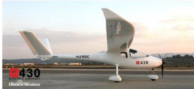
Figure 3. Battery electric aircraft: E430 electric aircraft.

The world's first commercial 100% electric E430 aircraft, manufactured in China, underwent a successful test flight on July 28, 2010, during the "Flying Conference" at Oshkosh Airport, Wisconsin, reaching a height of roughly 3000 meters (Figure 3). At the test site, there were 800000 spectators and around 10,000 aircraft, including the China E430 electric aircraft creative design team. The E430, which has a round shape and a V-shaped tail wing, a wingspan of 13.8 meters, a fuselage of roughly 7 meters, and the capacity to carry two passengers, was successfully taken offline in January 2009. Its performance is far superior to that of similar products around the world. On January 24, 2009, the E430 took off for the first time at an airport outside of Shanghai and achieved a number of technical milestones that qualify as the first in the world: the maximum takeoff weight is 430 kg; the top speed is 150 km/h; the economic speed is 95 km/h; it can be renewed for 2-3 hours; the charging time is 3-4 hours; and it costs about $5 per charge.